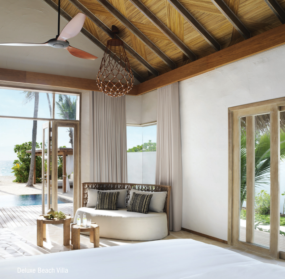
Deluxe Beach Villa