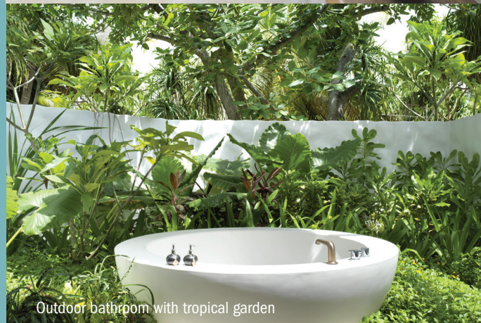
Outdoor bathroom with tropical garden