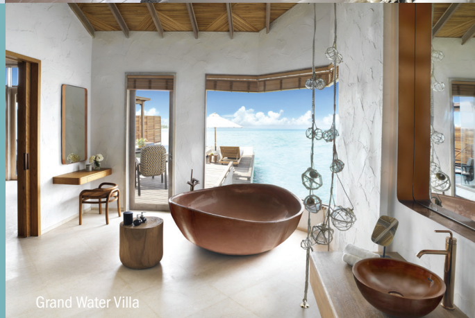
Grand Water Villa

The beaches sparkle a shade of white you've never seen before; the turquoise waters of the Indian Ocean glimmer in the tropical sun; the wind blows gently through mangrove and jungle. Welcome to Sirru Fen Fushi, or "Secret Water Island," the most exclusive island in all of the Maldives' 26 atolls. It's all yours to explore at Fairmont Maldives, Sirru Fen Fushi, where our sophisticated beach, over-water and jungle villas immerse you in comfort, romance and island charm. The sights and sounds of nature greet you each morning; the bounty of the ocean awaits at night. And all day long, the vibrant spirit of the Maldives shines through every inch of the island, showing you a life you always dreamed was possible.