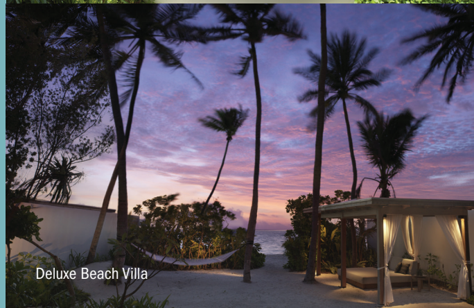
Deluxe Beach Villa