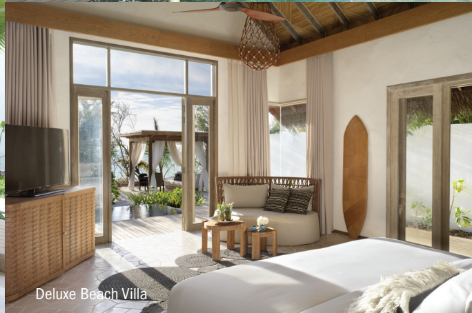
Deluxe Beach Villa